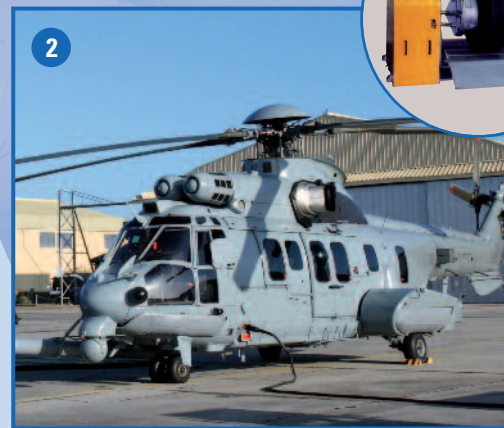
Tyre mounting/dismantling systems