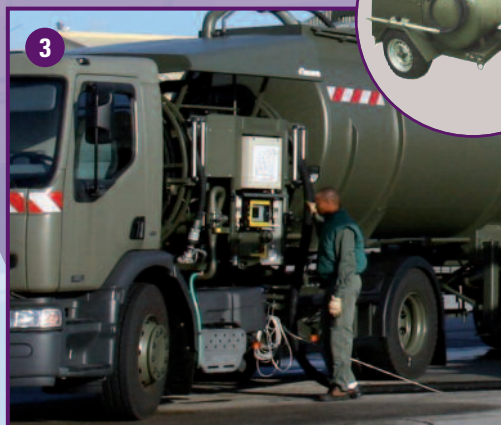
Fuel dispenser on tarmac