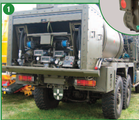
On board measuring units