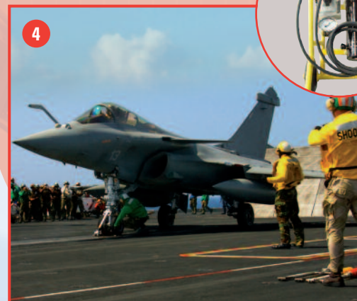
Aircraft tyre pressure adjustment